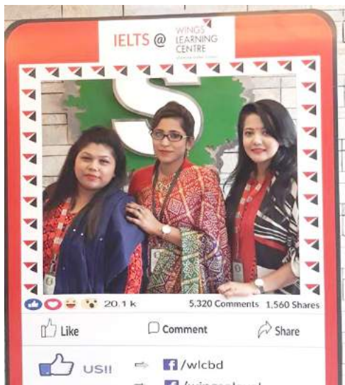
Selfie Contest participate WLC team

A selfie contest is a bit more complicated than a simple giveaway or sweepstakes. Alternatively you could run an Instagram hashtag contest, which automatically populates your campaign page.