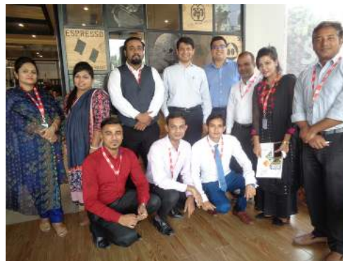
WLC Team Meeting with Managing Director

With some newly hired colleagues, a 9 member WLC team met honorable Managing Director on 15/11/2018. New members formally introduced themselves and demonstrated their recently assumed job roles.