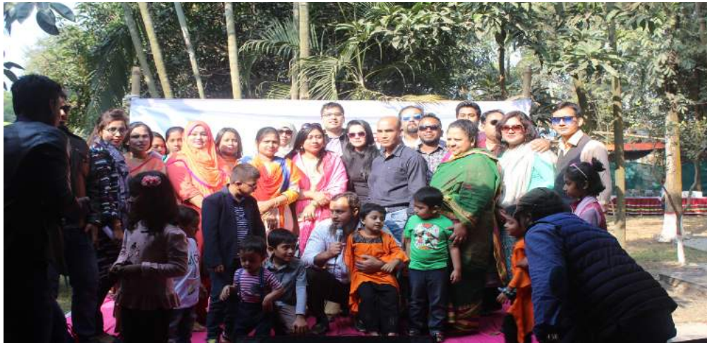
Sheba Group senior mangement, colleagues and their family members

On 11th January 2019 Sheba Group Annual picnic, 2019 was held at Sheba- Kunjo resort and convention center. WINGS Learning Centre participated in the program as one of the concern of Sheba Group.