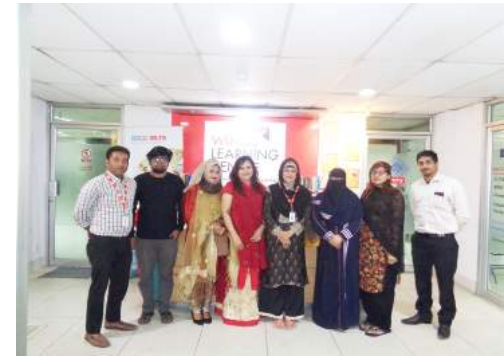
Some Members of WINGS O'Level Teacher's Pannel

Every week we meet with O level teachers to discuss study and exam plans, along with monitoring of student's progress. To ensure quality of our education, we have gathered top quality teachers to teach the various subjects. Every month, all the teachers have a meeting with the COO to discuss how to improve the quality of O level education further.