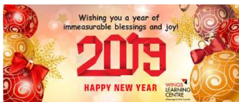
Visual for Happy New Year

From this session, club members improve their English communication skills, acquire a sense of: leadership, social & ethical responsibilities, co-operation and voluntary services.