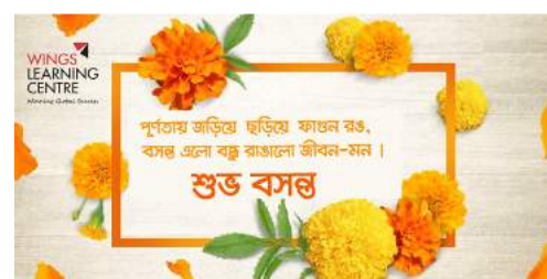
Visual of 1 St day Spring