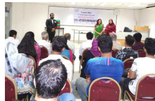
Guardian meet with Olevel teachers

WLC organizes many extra-curricular activities for student. We provide one-to-one care to every child from primary to Olevels. Also Every month we update the parents about their child's progress through parents teachers meeting. Likewise a parents meet was held earlier this month.