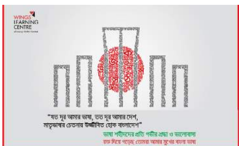
Visual of Martyrs Day & International Mother Language Day