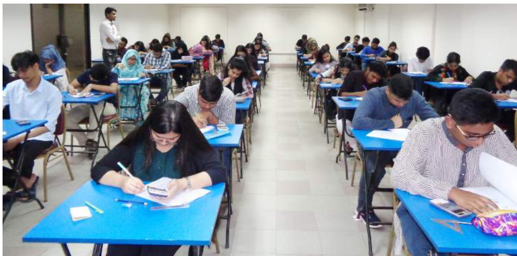
O Level Candidates are Giving ‘VEUNE MOCK’ Exams at WINGS

This is the first time ever that WINGS have conducted venue mock at WINGS Learning Centre. More than 400 students from different schools have taken this exam.