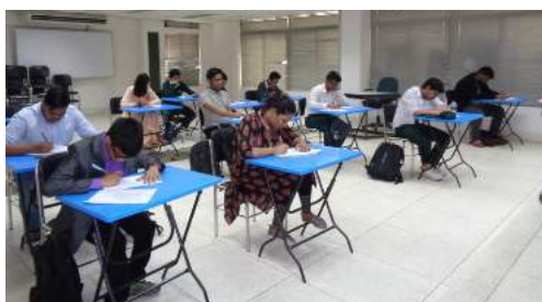
Officially Exam venue for O Level Education

prepare students for the actual exam. We are offering many different subjects from all backgrounds. The subjects include Mathematics, English, Economics, Bangladesh Studies, Commerce, Bengali, etc.