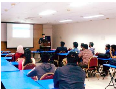
Open seminar "Successful Medical Career in the UK" held at WINGS

WINGS Learning Centre has become the official exam venue for MRCP exam since last October, 2018.