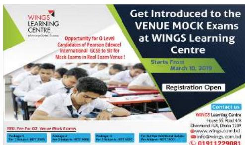
Visual for O' Level Venue Mock Exams

Followings are some of the greeting picture we have posted on January to April ;