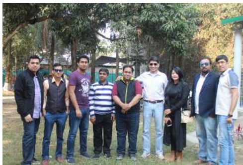
Managing Director of Sheba Group and senior mangement, with WLC team

The Annual picnic was arranged by the Sheba Group of L.td. All the senior management and the stuff of Sheba Group were participated in this program. The program started in the morning by the bus journey from 8.00 am.