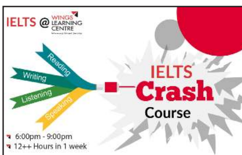
IELTS crash courses at WINGS

IELTS Crash Booster course aims the candidates needing relatively higher scores. It is a setup for the candidate to prepare them in broadly intensive manner. The is designed to ensure adequate time for lecture followed by substantial amount of real time practice at the presence of the teacher which is helpful removing all possible hurdles. The course is conducted by the senior most teachers of WINGS Learning Centre who can be called future Examiners for IELTS.