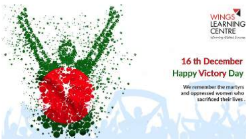
Visual for our National Victory Day