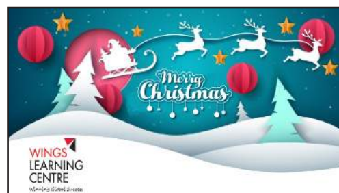
Visual for Merry Christmas Day