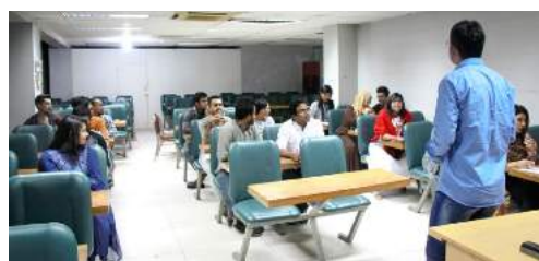
Visual for our National Martyred Intellectuals Day

WINGS Language Club was formed in Spring 2000 with a view to improving students' English language skills. On every Saturday, the club arranges an open spoken English session for members that directed by a proficient English language trainer.