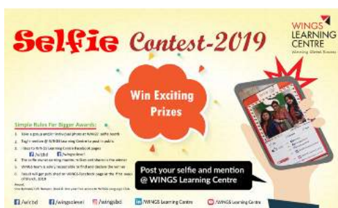
Visual for Selfie Contest -2019