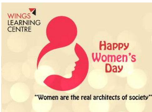
Visual of International Women's Day