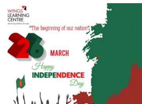
Visual of our Independence Day