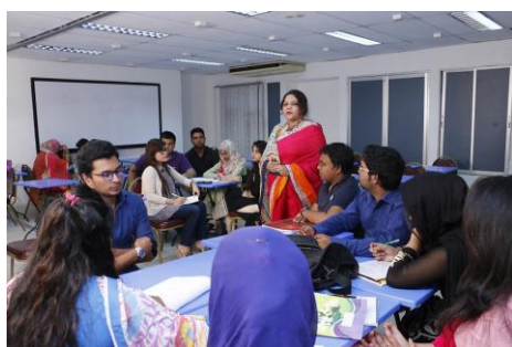
Club session at WLC language club

From this session, club members improve their English communication skills, acquire a sense of: leadership, social & ethical responsibilities, cooperation and voluntary services.