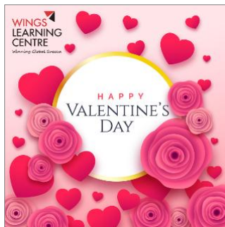
Visual of Valentine's Day