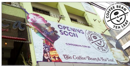
The Coffee Bean & Tea Leaf (Opening soon)