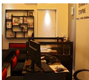
IELTS registration point at WLC