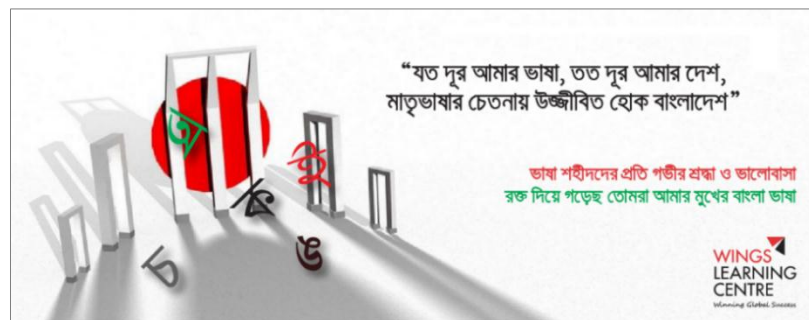
Visual of Martyrs Day & International Mother Language Day