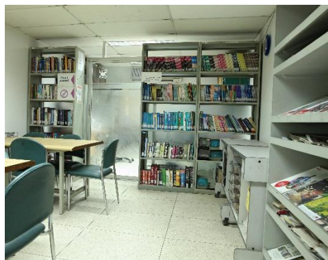
Student reading area at WLC resource centre

The Resource Centre of WINGS Learning Centre is very complete for diligent study. The establishment of this facility goes long back in the time Victoria University of Melbourne having their offshore campus right at WLC. The resources are of very high standard with original copies of multi-disciplinary books and diversified study materials. Regular programs at WLC feature some activities related to efficient use of the resource centre. The participants of all WLC programs take the full advantage of this enriched resource centre as they are given easy and default access to that.