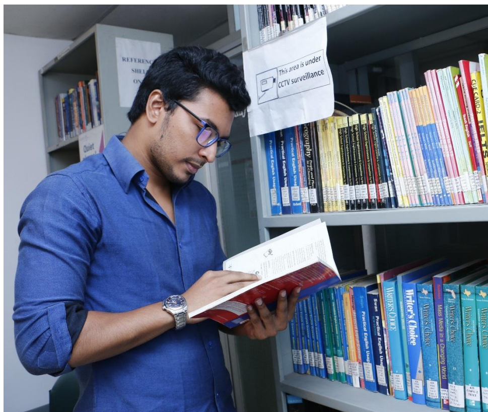
An IELTS student at WLC resource centre