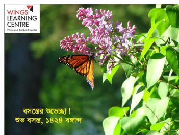
Visual of 1 st day of Spring

Followings are some of the greeting picture we have posted on February;